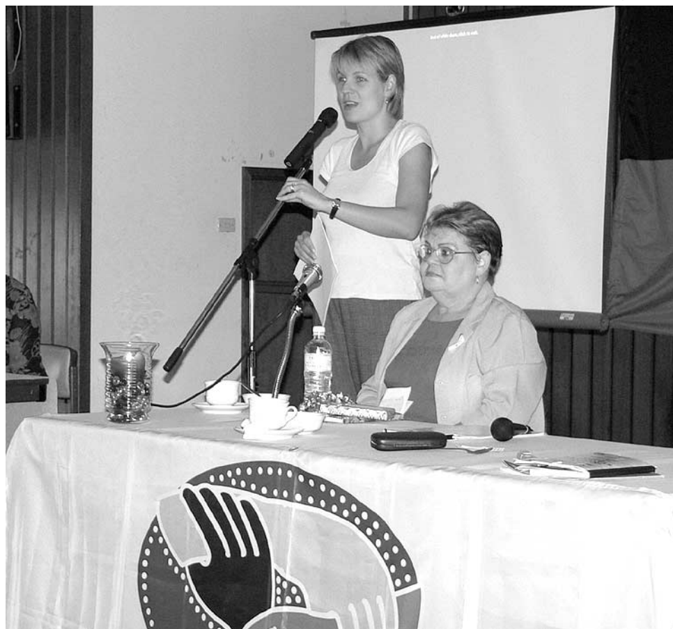
Tanya Plibersek, Shadow Minister for Work and Family, Childcare and Youth, and Women, addresses the conference at the Bowling Club on Friday.

The Women's Refuge Movement ended their Conference in Bourke last week by launching the Orana Safe Houses Project in conjunction with Stop Domestic Violence Day on Friday.